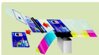
Re-Transfer printing process