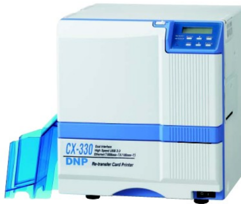
CX-330 Re-transfer card printer